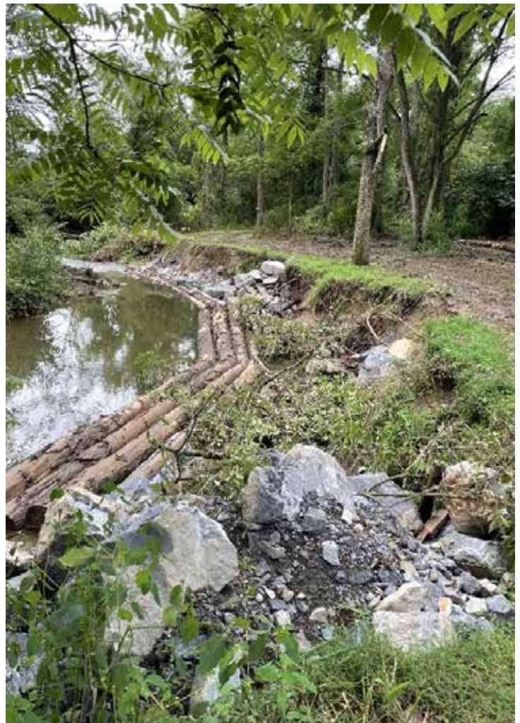
Your support of NPC is helping to restore the health of Warrior Run in Northumberland County.

Using Growing Greener Grant funding, NPC worked with our partners at the Pennsylvania Fish and Boat Commission, Northumberland County Conservation District, and Pennsylvania Department of Environmental Protection to install log and rock structures along a stretch of the stream. We'll be back in 2025 to continue working on the segment of stream that the School District owns and decrease the sediment going into Warrior Run.