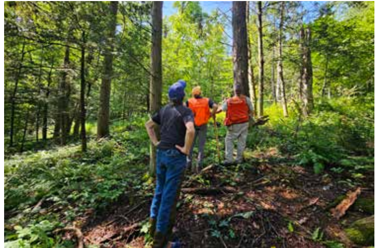
The landowners of the Laning Creek conservation easement walk the property with the Forester, helping to develop a forest management plan.

NPC received a grant from WeConservePA to offset the costs of developing forest management plans for land under conservation easement in the Chesapeake Bay watershed. The plans are a tool to help landowners as they make management decisions for their woods. The plans will be wrapped up by the end of the year. Some landowners are already implementing their forest management plans. Thank you to our members for allowing NPC to have staff ready and available to work with landowners and manage grants.